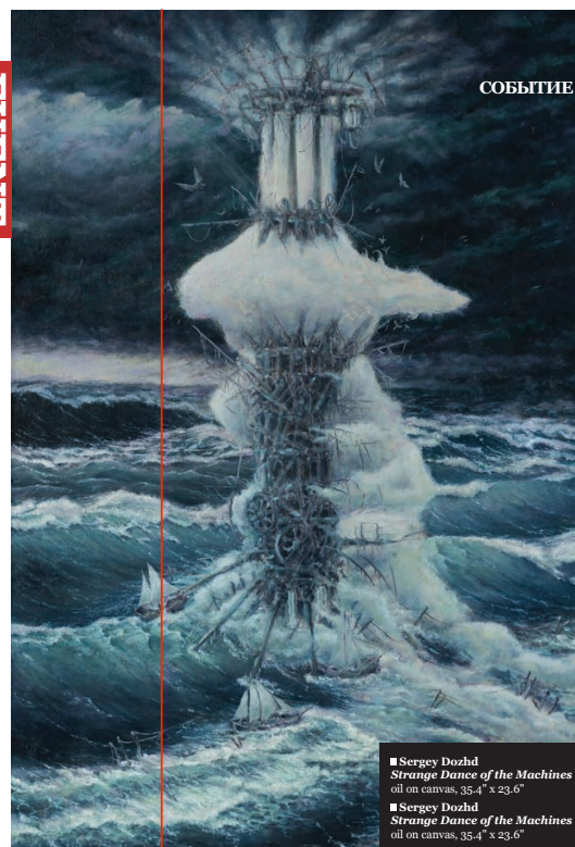
■ Sergey Dozhd Strange Dance of the Machines oil on canvas, 35.4" x 23.6"