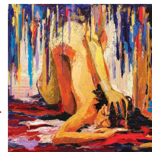
■ Daria Bagrintseva Voluntary Submission acrylic on canvas, 59.1" x 59.1"