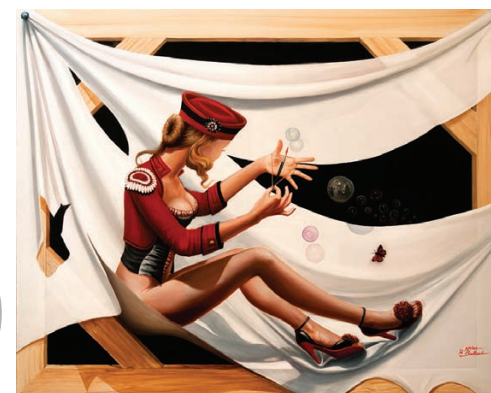
■ Michel Boulboul Astral Target oil on canvas 48" x 60"