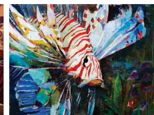
■ Daria Bagrintseva Big dragon acrylic on canvas, 78.7" x 118.1"